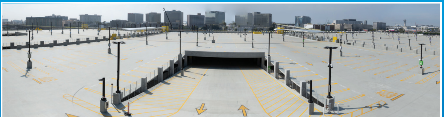
LAX (575,000 sqft of Vehicular Traffic coatings)

7 Manufacturing Locations Across the USA