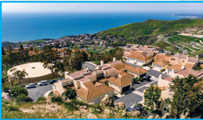
Pepperdine University (Pedestrian Deck)

Decorative Flooring Spray Foam Roofing & Insulation Systems Theming & Prop Industry Recreation & Sports Surfaces Binders Polyurethane Tire Fill Release Agents