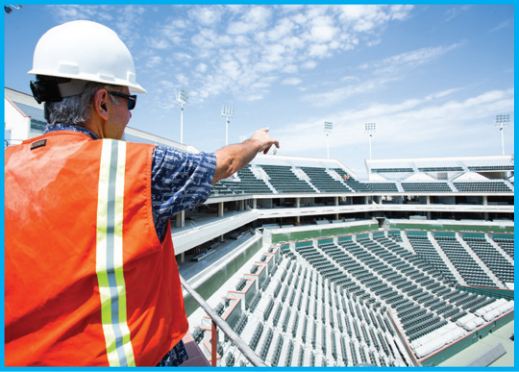
Indian Wells Stadium (Waterproofing)