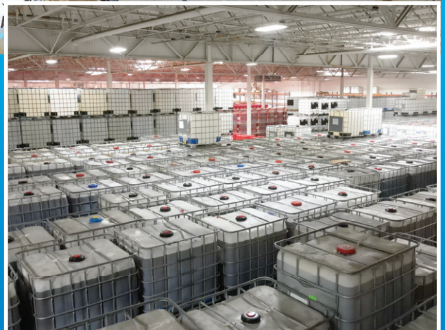
Warehouse, Manufacturing, and Distribution Locations across the U.S.