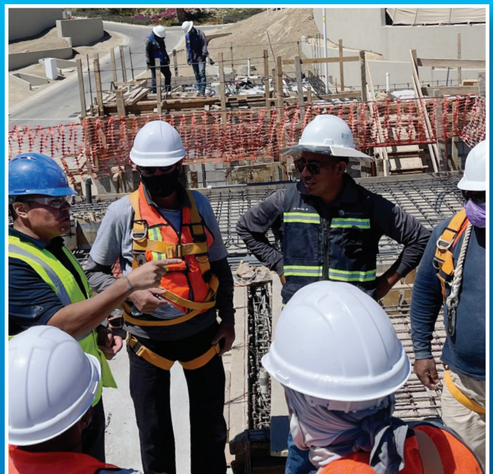
Polycoat sales rep on-site in Mexico

For almost 40 years, Polycoat Products has had a customer service-oriented approach to business. This plays a critical role in customers' satisfaction and building strong customer relationships. In addition to on-site support and hands-on field service capabilities, we offer multi-channel customer service through live chat and live video-based communication for remote diagnostics and resolutions.