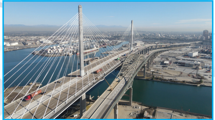
Long Beach Bridge (Pedestrian Deck)