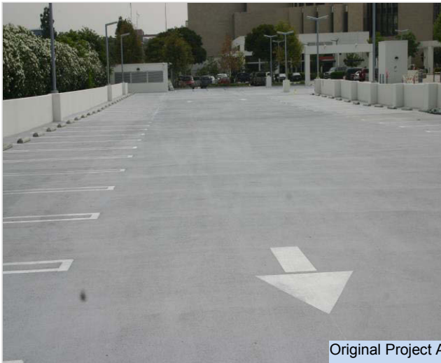
Original Project Application in 2006