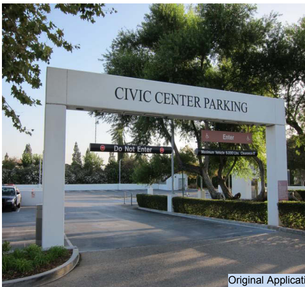
Original Application After 6 Years (2012)