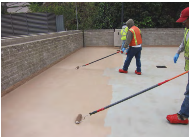
BELOW ▼ The crew used squeegees and rollers to apply the Polyglaze 100SC topcoat in two 12 mil (304.8 microns) thick topcoats.

In addition, each crew member wore the appropriate personal protective equipment (PPE) for various stages of the job, including goggles, gloves, hardhats, boots, and respirators.