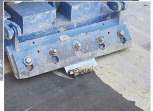
ABOVE ▲ In order to remove the failed coating, California Restoration & Waterproofing subcontracted with Blason Industries. The Blason crew used a Blastrac shot blaster among other equipment (inset) to remove the existing coating from the deck.

polyurethane elastomeric waterproofing base membrane. Using notched squeegees and rollers, the crew applied the PC-235SC at a thickness of approximately 19 mils (482.6 microns). The crew then misted the deck with water to activate the basecoat.