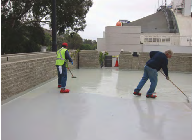
ABOVE ▲ After they mapped out the high traffic areas, the crew applied a second coat of the PC-235SC to those sections at a thickness of approximately 11 mils (279.4 microns).

100SC. With these curing accelerants, the cure times were back on track, and the crew didn't waste time standing around in the unseasonably chilly weather.