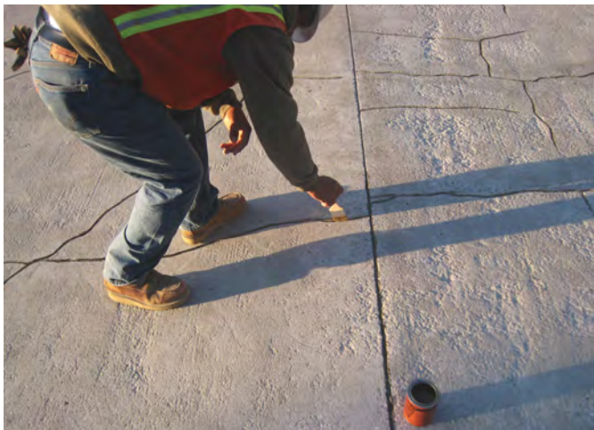
ABOVE ▲ The crew used a two-part, gun-grade sealant to prime and caulk cracks and control joints. According to Gilbertson, any excess caulking was removed, and the sealant was tooled.

the two-week-long coating job. “The project took place during January and February 2012, when the Los Angeles area saw unusually low temperatures and very low relative humidity,” says van der Capellen.