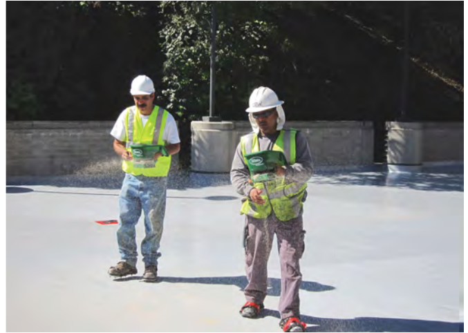
ABOVE ▲ Immediately following the application of the second coat of PC-235SC, the crew broadcast Monterey sand #1/20 mesh into the wet coating to create a slip-resistant finish