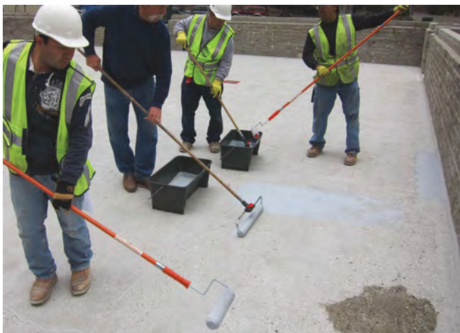
BELOW ▼ Working in sections, the California Restoration & Waterproofing crew used rollers to apply two coats of Polyprime 2180SC at a thickness of approximately 6 mils (152.4 microns) in thicknesses of 3 mils (76.2 microns) per coat.

To combat this situation, Gilbertson and his crew added moisture-curing enhancements to both the basecoat and topcoats. PC-50 was added to the PC-235SC and Polyglaze Hardener was added to the Poly-I-Gard 246SC and the Polyglaze